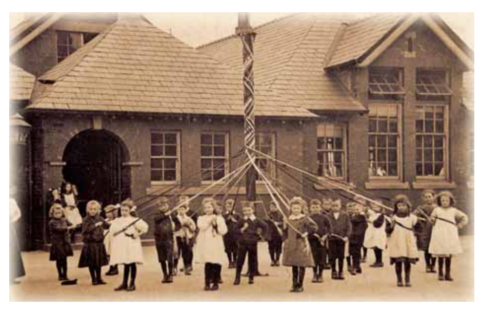
May Day at Lostock Hall Council School, 1903