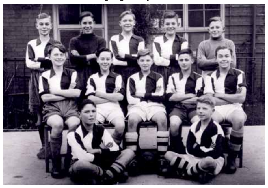
Lostock Hall Council School F.C. 1948 Do you know any of these players?